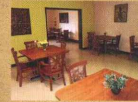
Beautiful Dining Room

We understand that this is a very difficult decision for any family and a confusing time for some. Our Social Services Director is available to answer any questions you may have, give you a tour of the facility, and make the transition as smooth as possible.