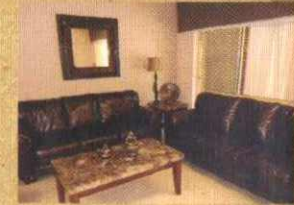
Comforts of Home