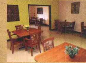
Beautiful Dining Room

We understand that this is a very difficult decision for any family and a confusing time for some. Our Social Services Director is available to answer any questions you may have, give you a tour of the facility, and make the transition as smooth as possible.